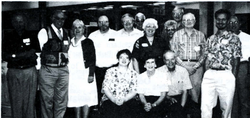
Donor-Participants Celebrate a "Picnic in the Library"