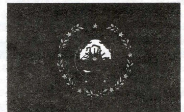
STATE FLAG OF NEW HAMPSHIRE