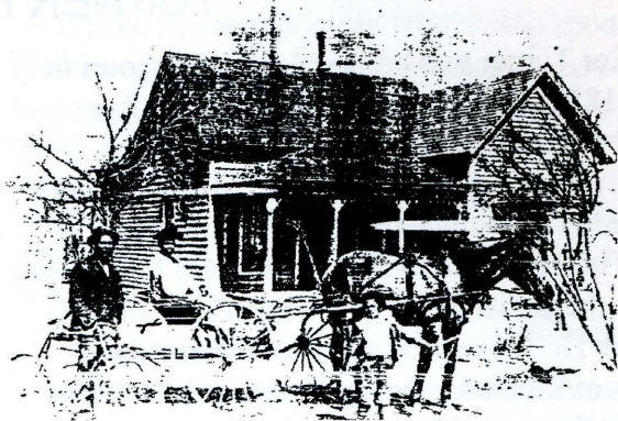
The Turner Family, circa 1900