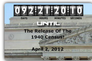
Countdown to the release of the 1940 Census, April 2, 2012!

Census Questions – The questions on the 1940 form included the standard information about name, sex, color or race, age, marital status, education, and place of birth among others. It also included questions about employment status for persons over 14 as well as the individual's occupation. For the first time, the enumerator was asked to place a circled X by the name of the person furnishing the information about the family and to specify their income for the 12 months ending December 31, 1939. Another question asked all women who were or had been married if they had been married more than once and at what age they were married the first time. A complete list of questions is available at www.nara.gov .