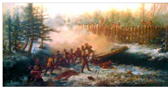
The Great Swamp Fight