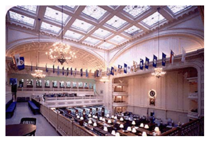
DAR Library, Washington, D.C.

From novices to professionals, the DAR Library offers a wealth of unique materials for researchers of all levels. Since its founding in 1896, the DAR Library has grown into a specialized collection of American genealogical and historical manuscripts and publications, as well as powerful on-site databases. The DAR Library collection contains more than 225,000 books, 10,000 research files, thousands of manuscript items, and special collections of African American, Native American, and women's history, genealogy, and culture. Nearly 40,000 family histories and genealogies comprise a major portion of the book collection, many of which are unique or available in only a few libraries in the country.