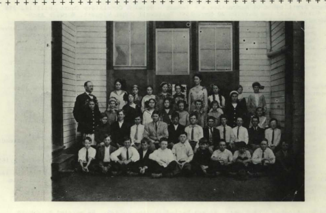
1912 - RUNGE, TEXAS - FIFTH GRADE CLASS

miles outre being the first of account of