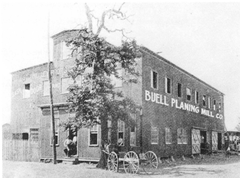
Figure 3 - ca. 1900

John: No, down around the suburbs, but there wasn't suburbs. Dallas wasn't big enough to have suburbs. But, anyhow, they run one of them cars up there on Live Oak. Right just before they got to the tracks, they stopped it right at the tracks. The fire hemmed it in and burnt the car up. I was there...I seen that.