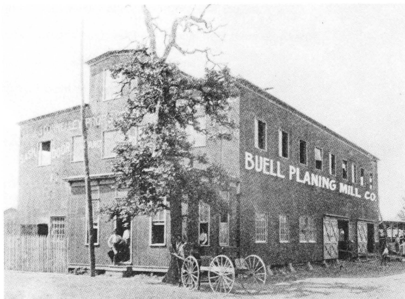
Figure 3 - ca. 1900

John: No, down around the suburbs, but there wasn't suburbs. Dallas wasn't big enough to have suburbs. But, anyhow, they run one of them cars up there on Live Oak. Right just before they got to the tracks, they stopped it right at the tracks. The fire hemmed it in and burnt the car up. I was there...I seen that.