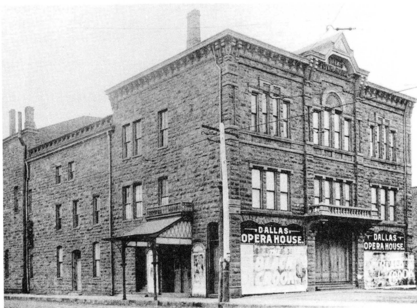
Figure 2 - ca. 1895