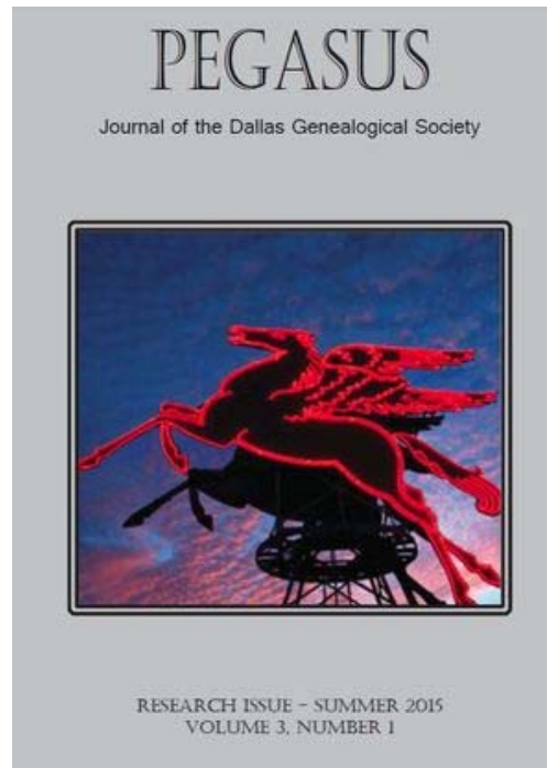
Summer 2015 Research Issue

Members who want to read the electronic version may access the full issue on our web site by clicking on the cover page below.