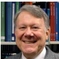
Session 4: Creating a Family History of Lasting Value

Cost (Includes parking in the Jonsson Central Library garage). $60 (Member); $70 (Non-Member) Lunch, optional ($12)